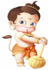
Star Gold :Sunday, 10:45am