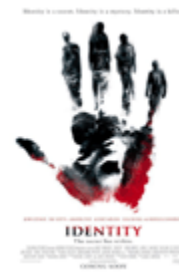
AXN: Sunday, 3:00pm