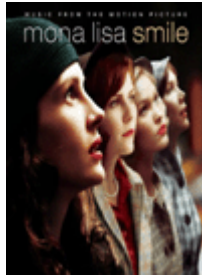
Star Movies: Sunday, 2:55pm