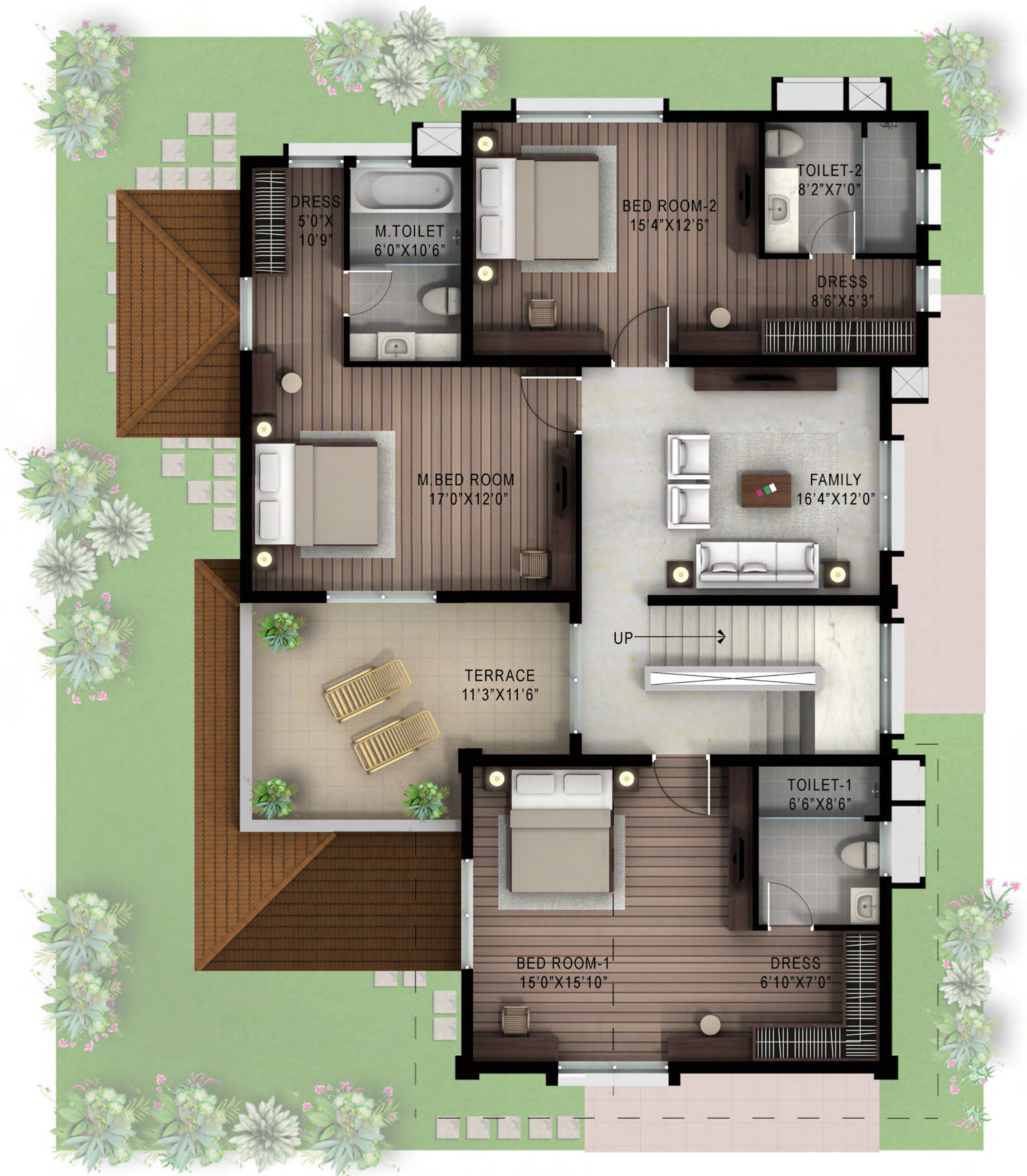
FIRST FLOOR PLAN VILLA 50 X 60