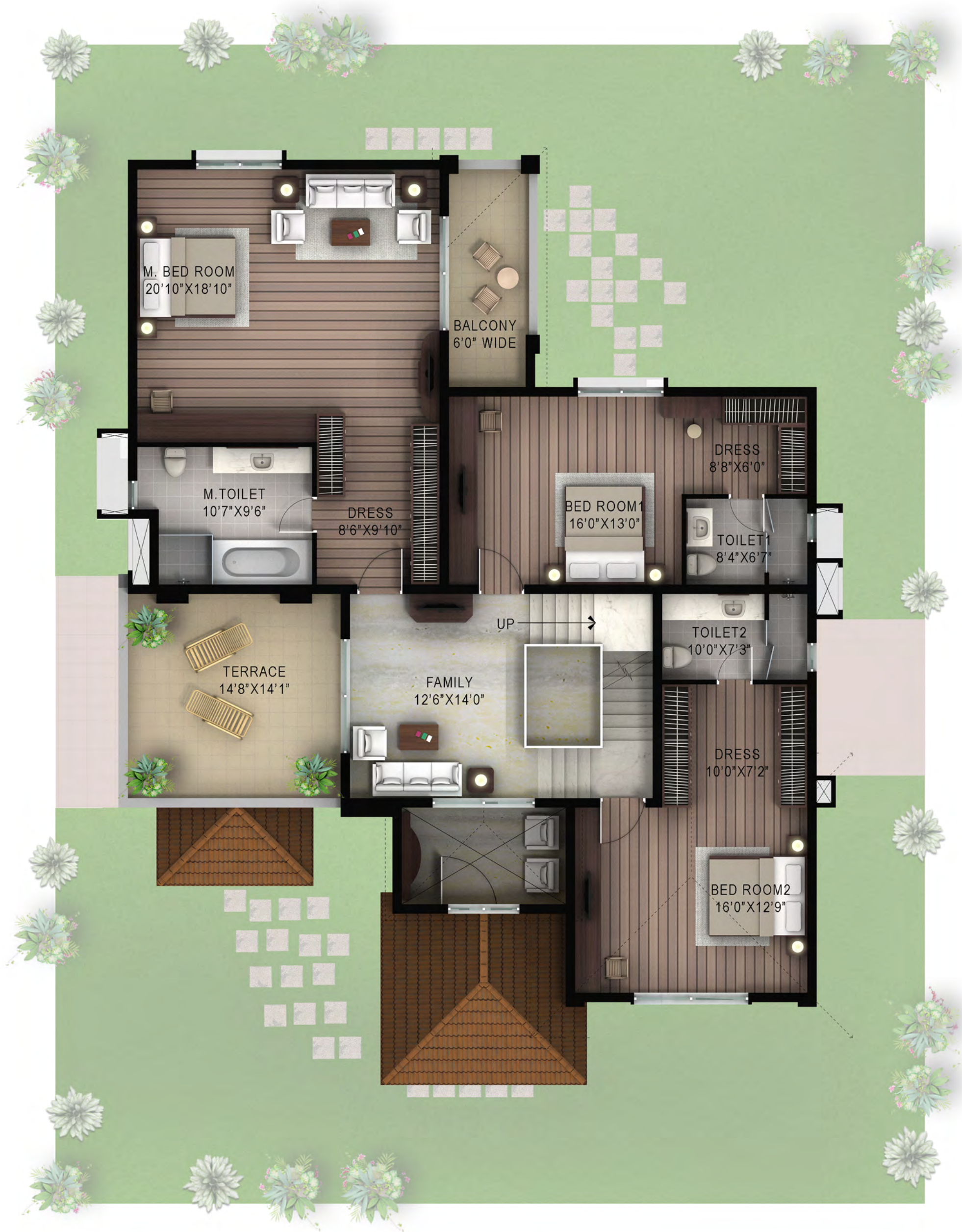
FIRST FLOOR PLAN VILLA 60 X 80