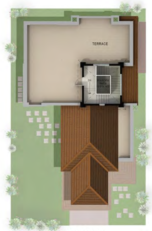
TERRACE FLOOR PLAN VILLA 50 X 80