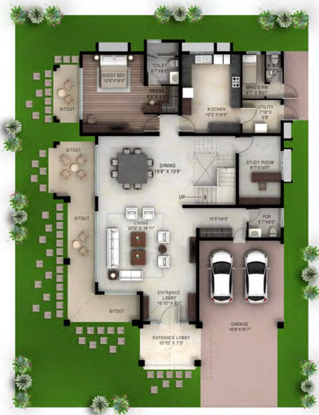
GROUND FLOOR PLAN VILL 60 X 80DH