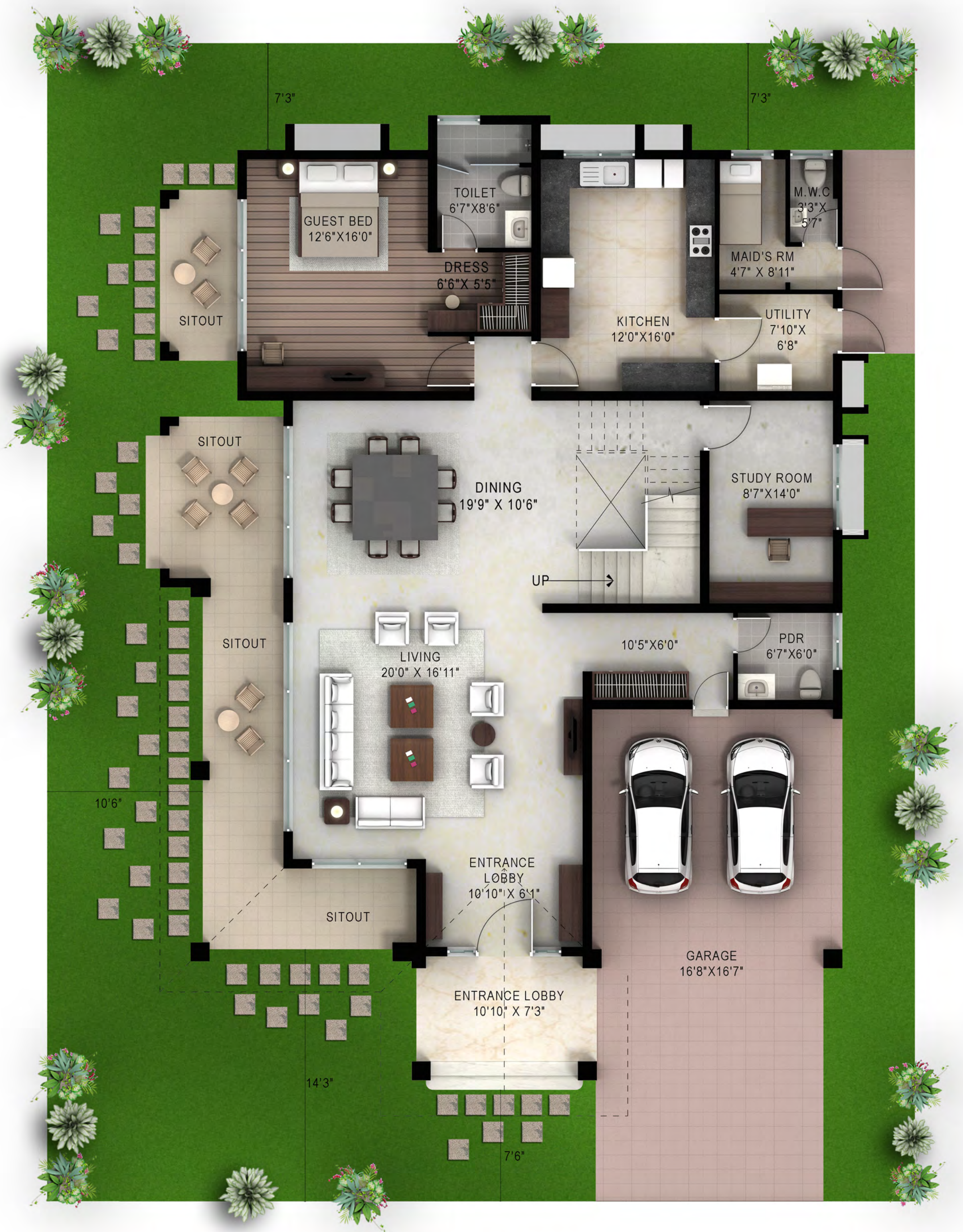
GROUND FLOOR PLAN VILL 60 X 80DH