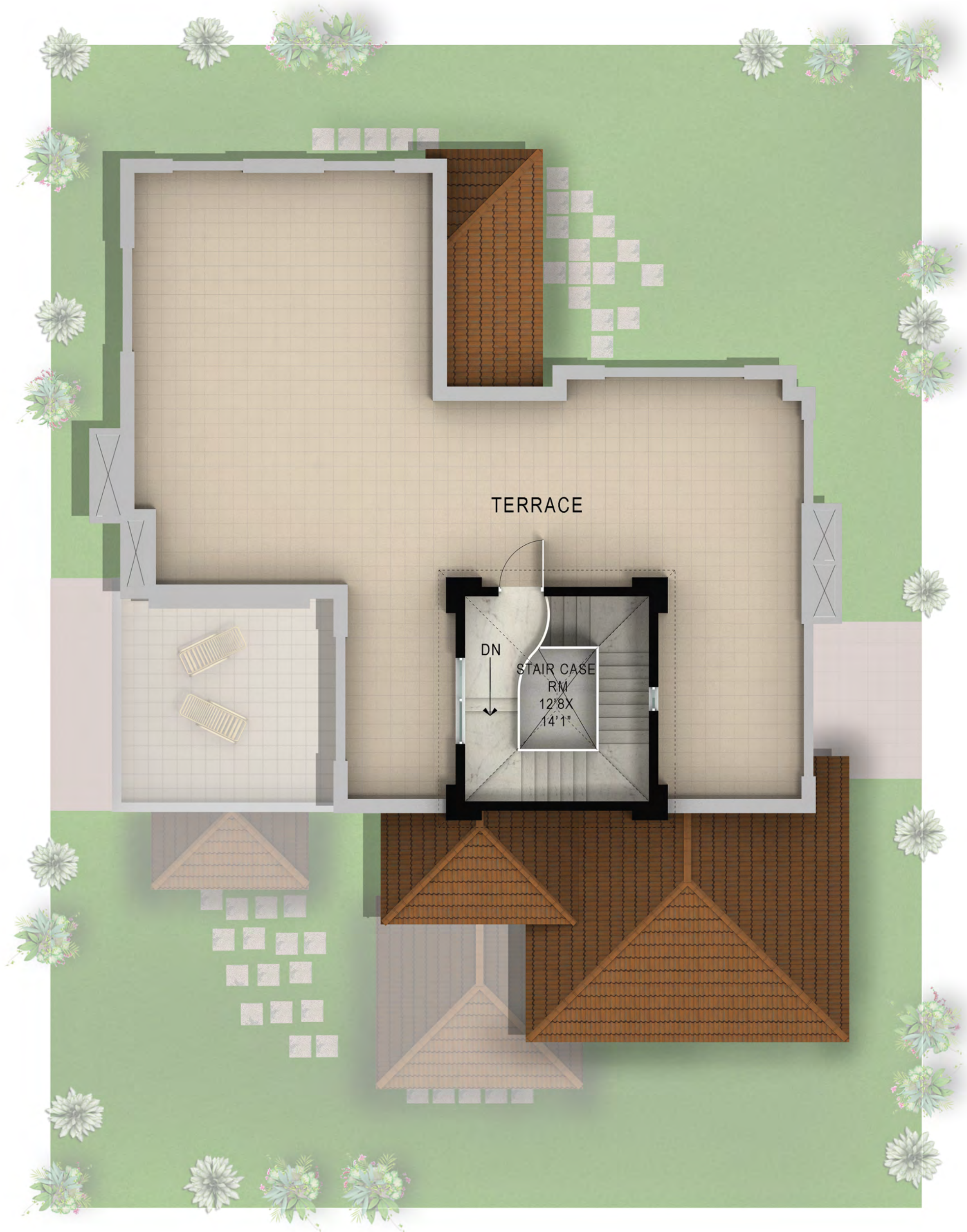
TERRACE FLOOR PLAN VILLA 60 X 80