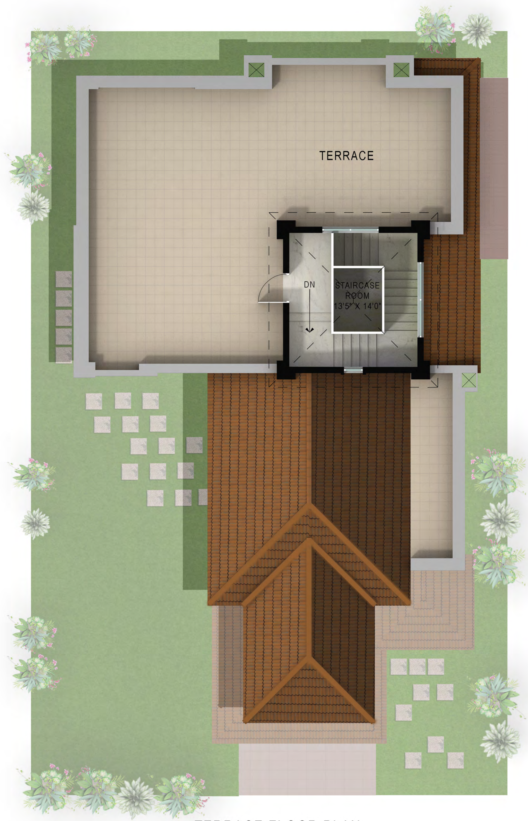
TERRACE FLOOR PLAN VILLA 50 X 80