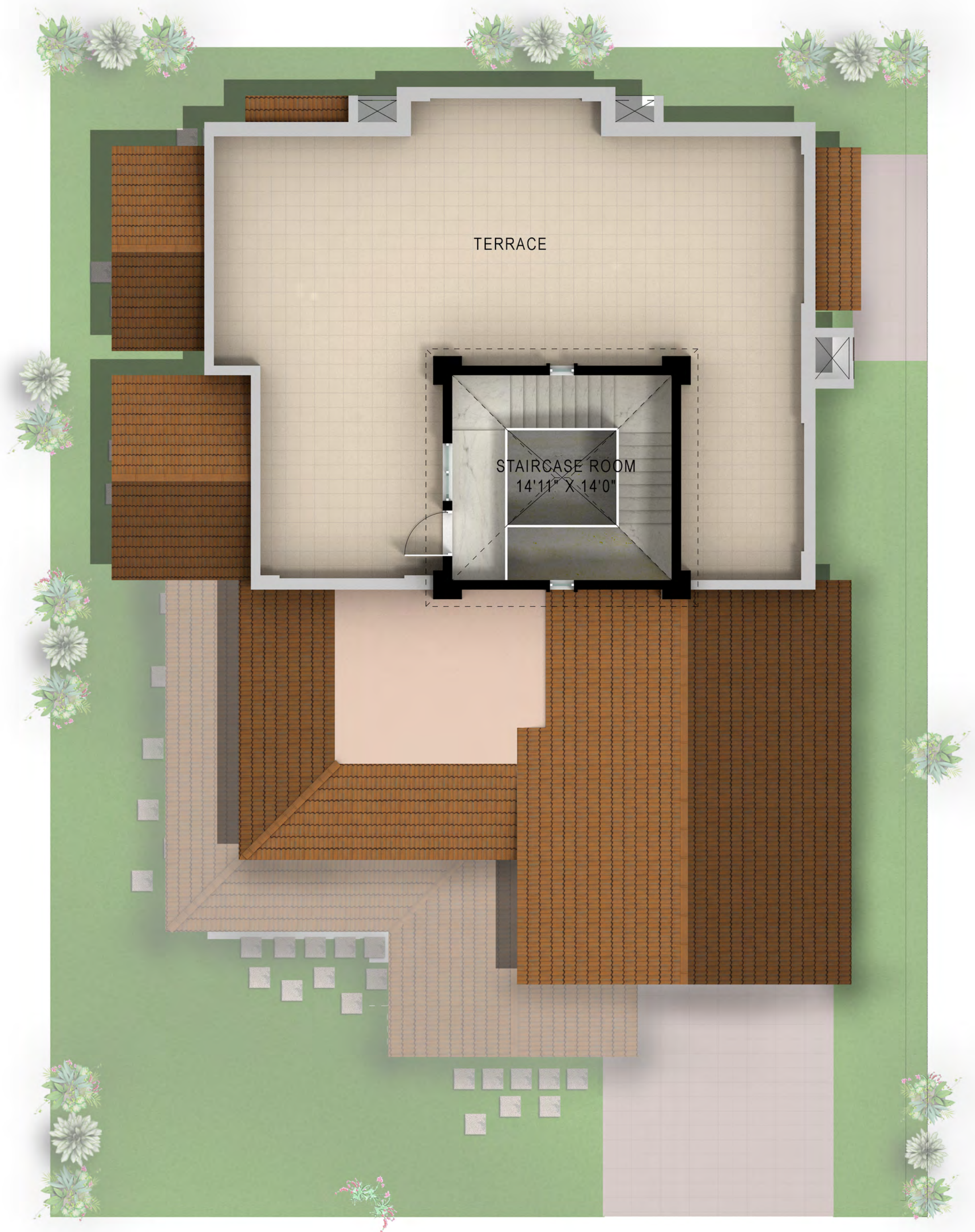
TERRACE FLOOR PLAN VILL 60 X 80DH