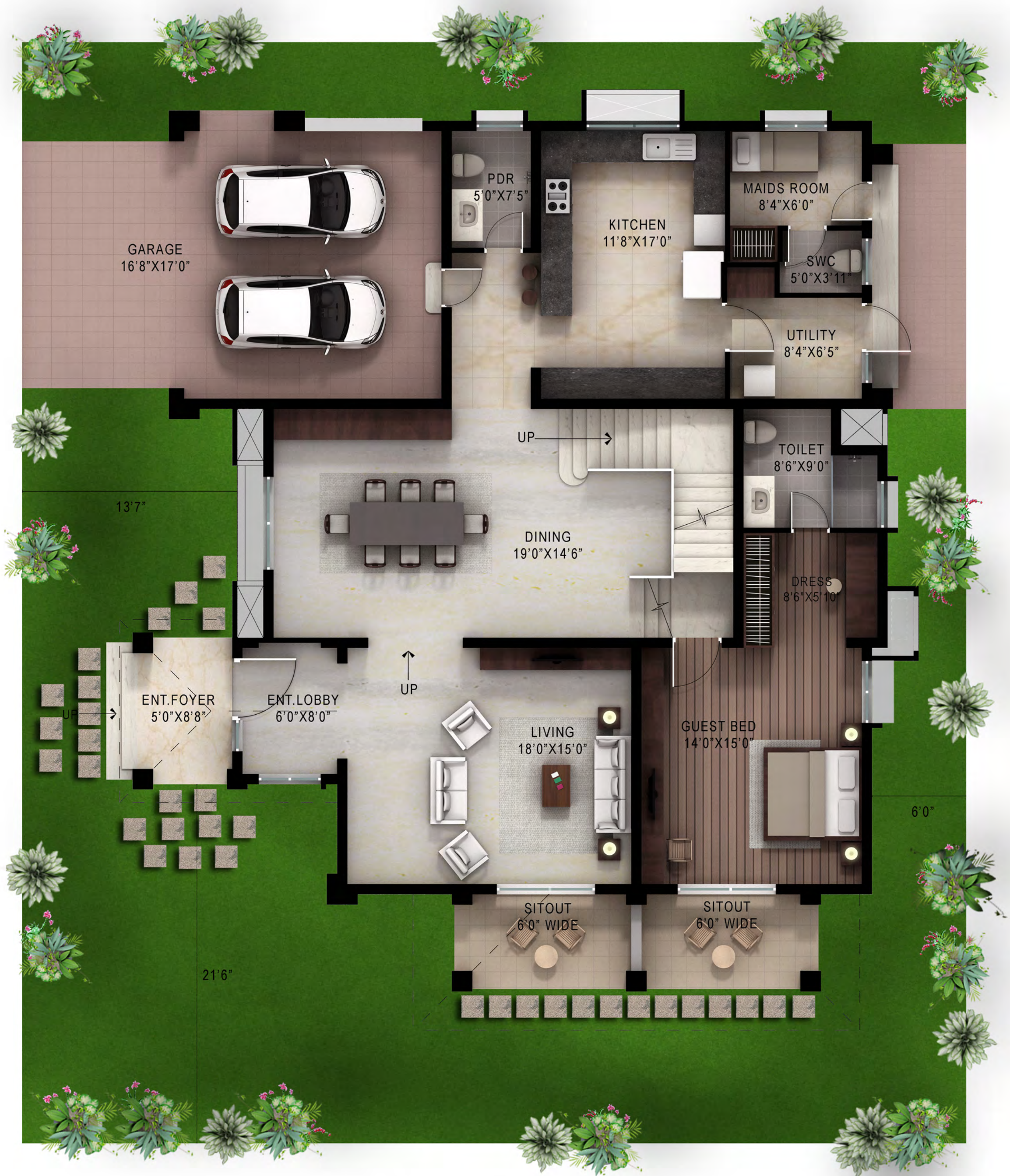
GROUND FLOOR PLAN VILLA 60 X 70