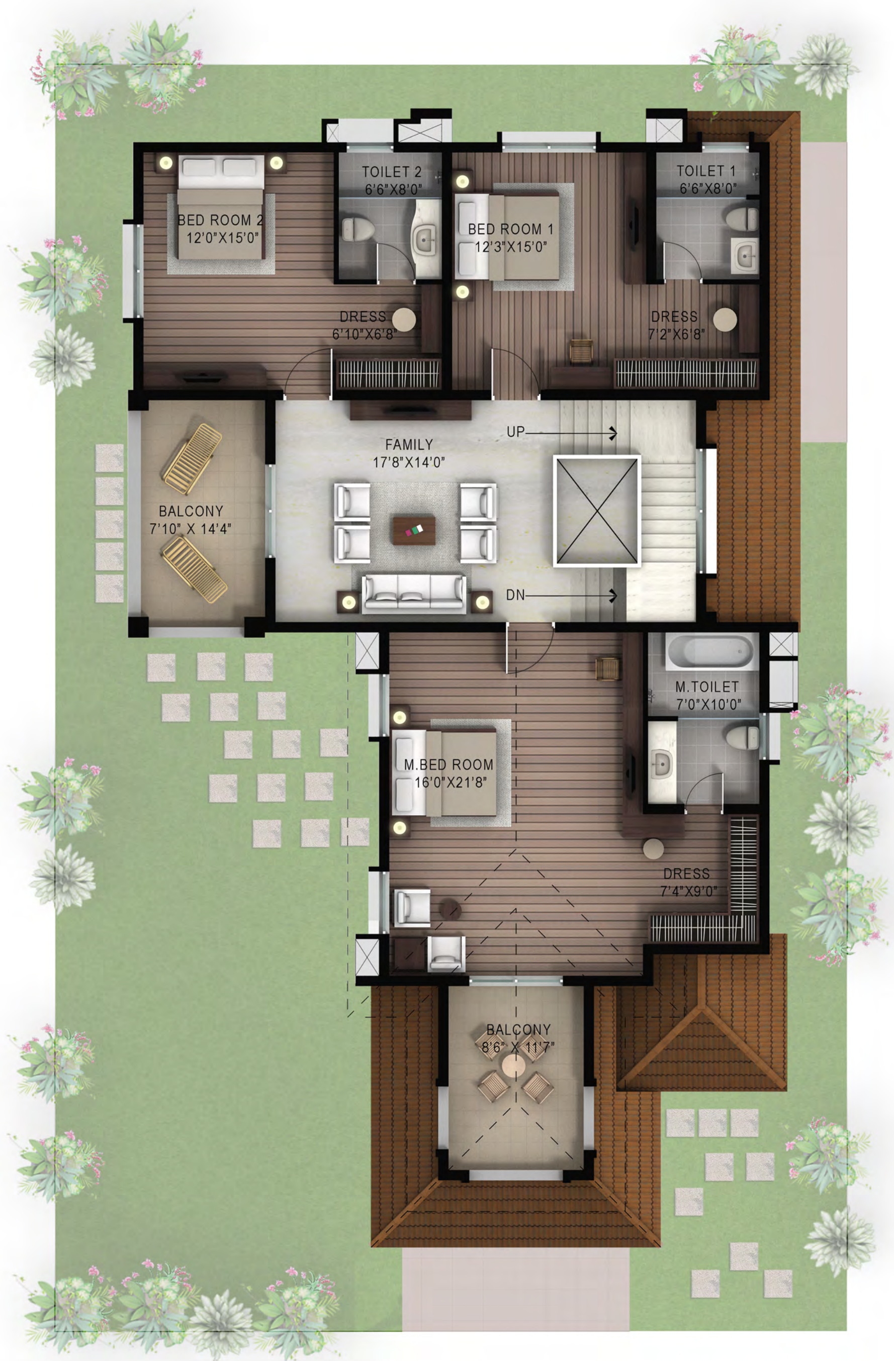
FIRST FLOOR PLAN VILLA 50 X 80