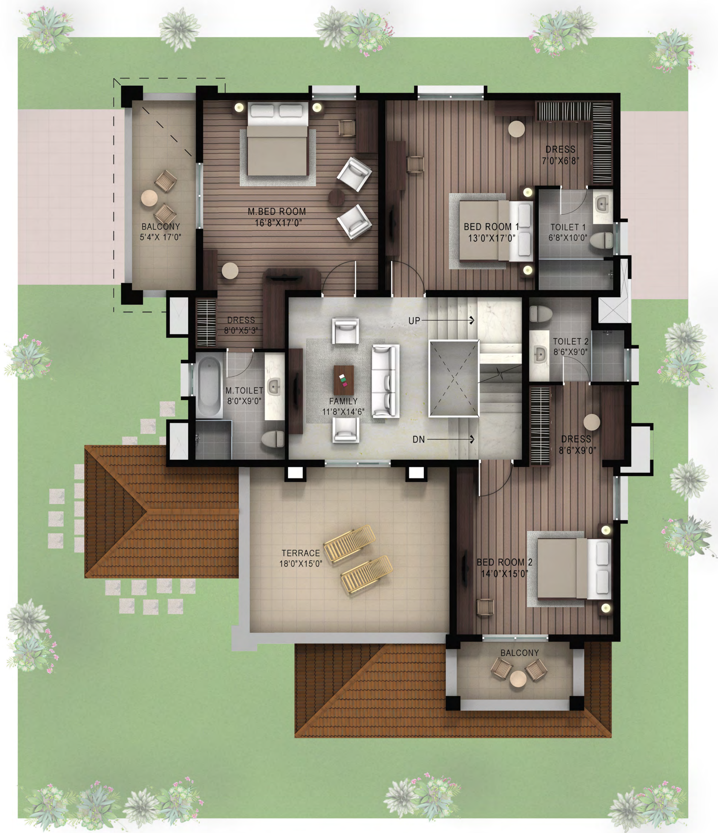
FIRST FLOOR PLAN VILLA 60 X 70