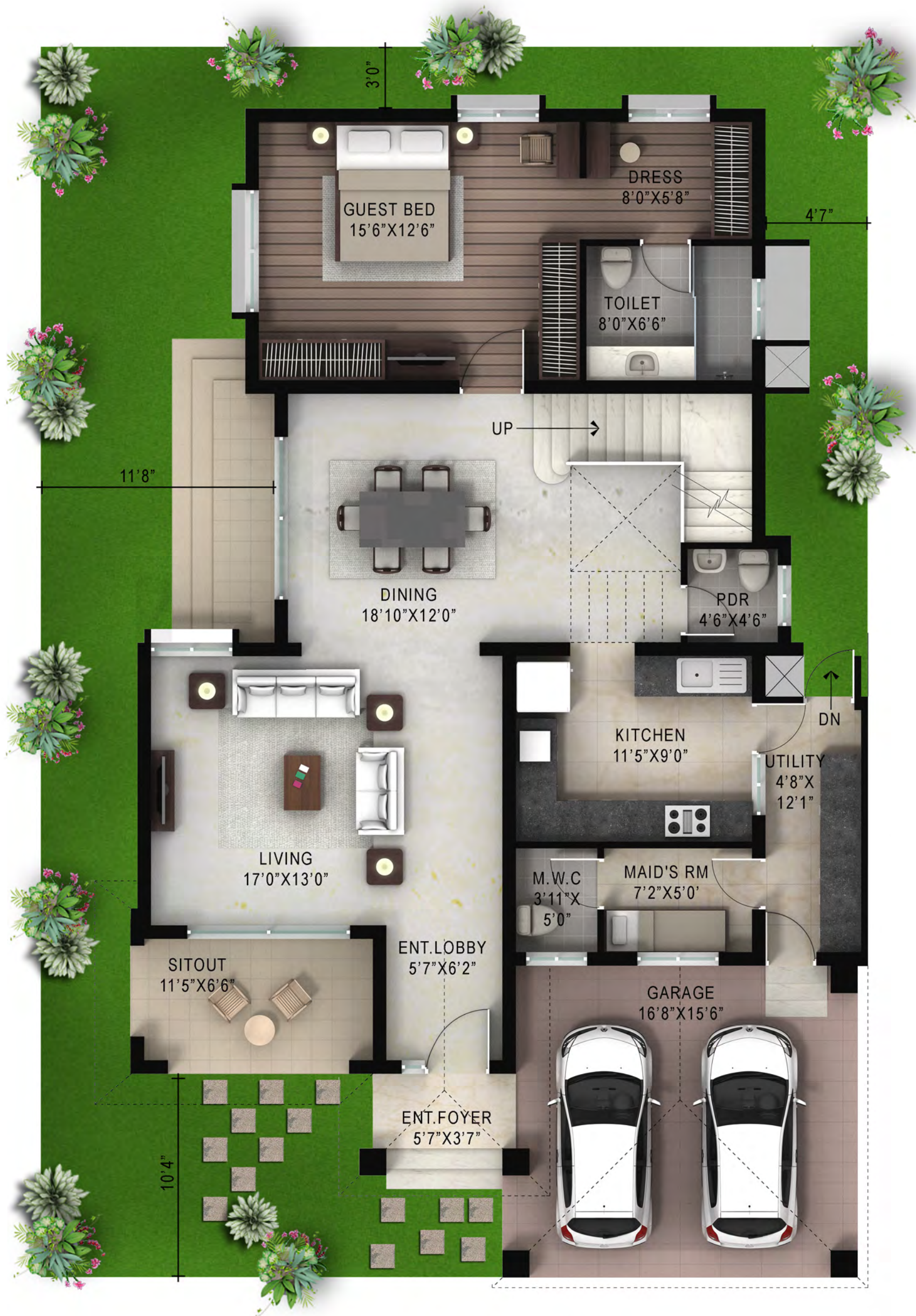
GROUND FLOOR PLAN VILLA 40 X 60