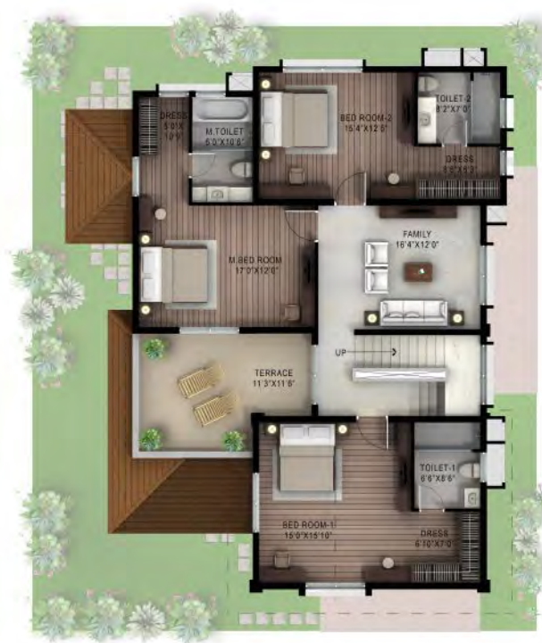
FIRST FLOOR PLAN VILLA 50 X 60