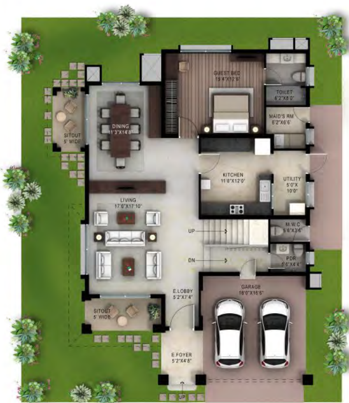
GROUND FLOOR PLAN VILLA 50 X 60