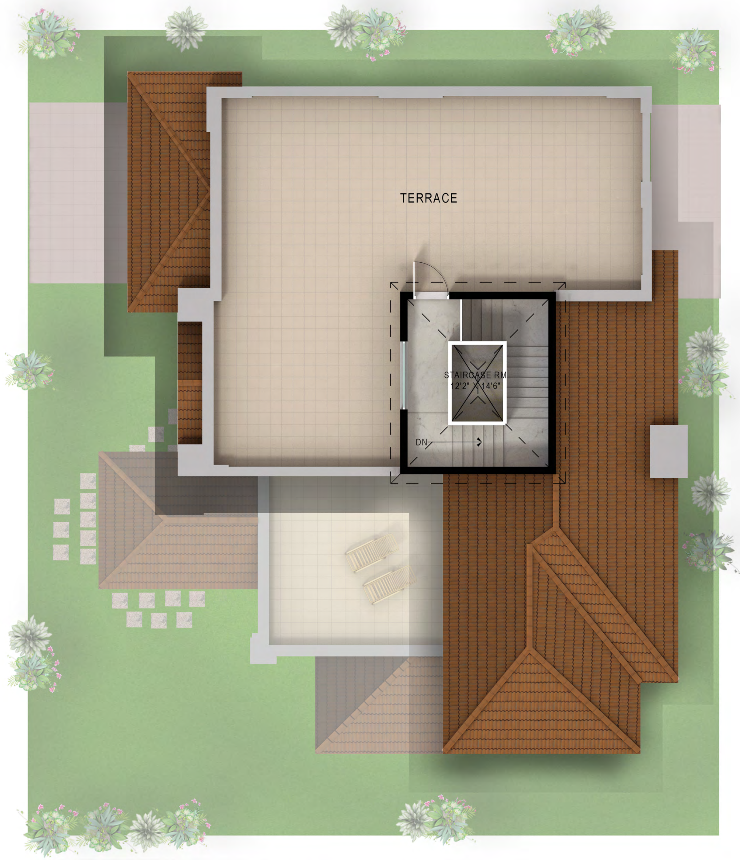
TERRACE FLOOR PLAN VILLA 60 X 70