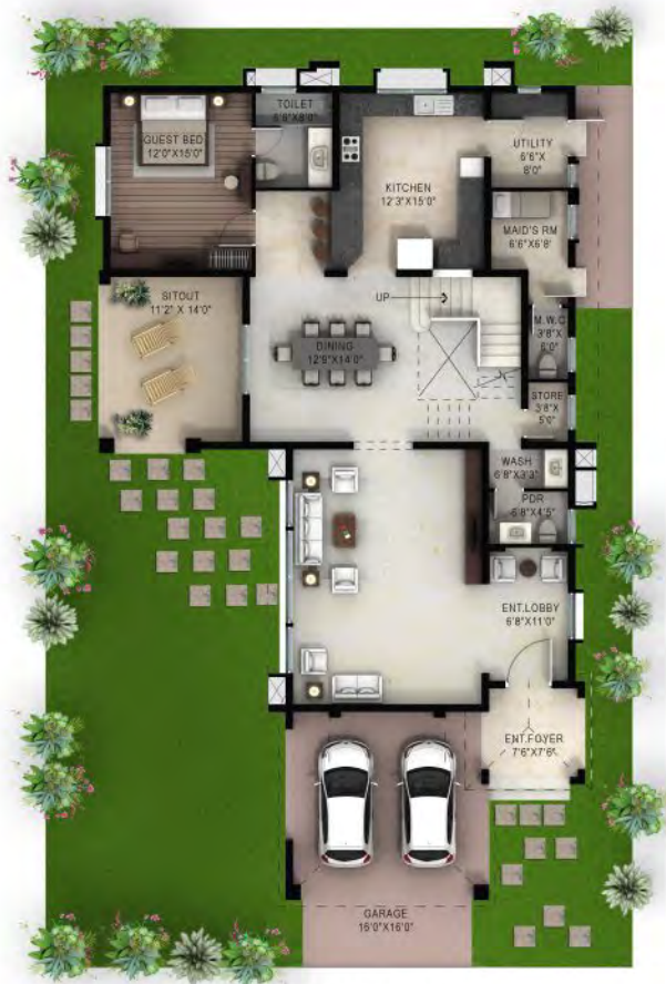
GROUND FLOOR PLAN VILLA 50 X 80