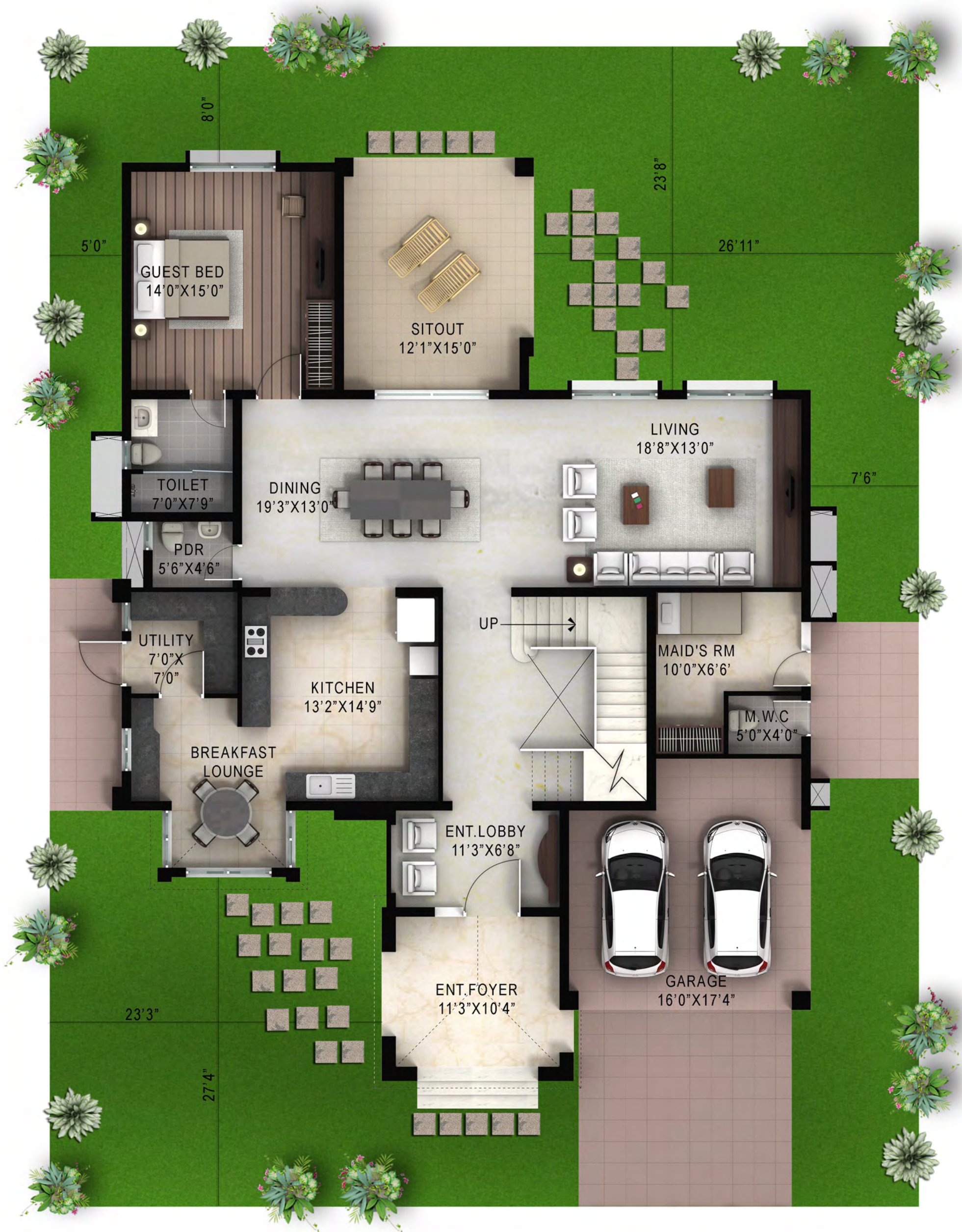
GROUND FLOOR PLAN VILLA 60 X 80