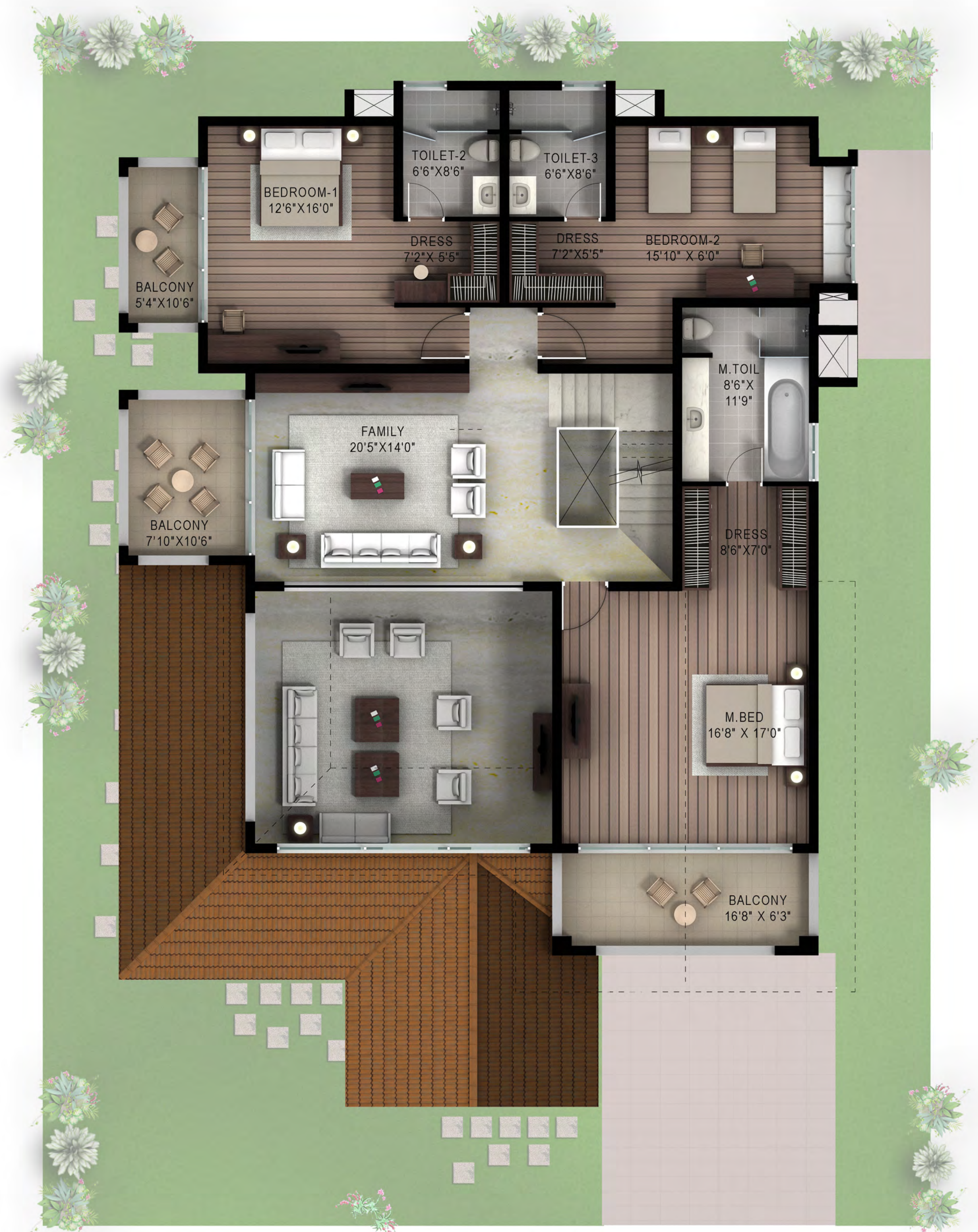
FIRST FLOOR PLAN VILL 60 X 80DH