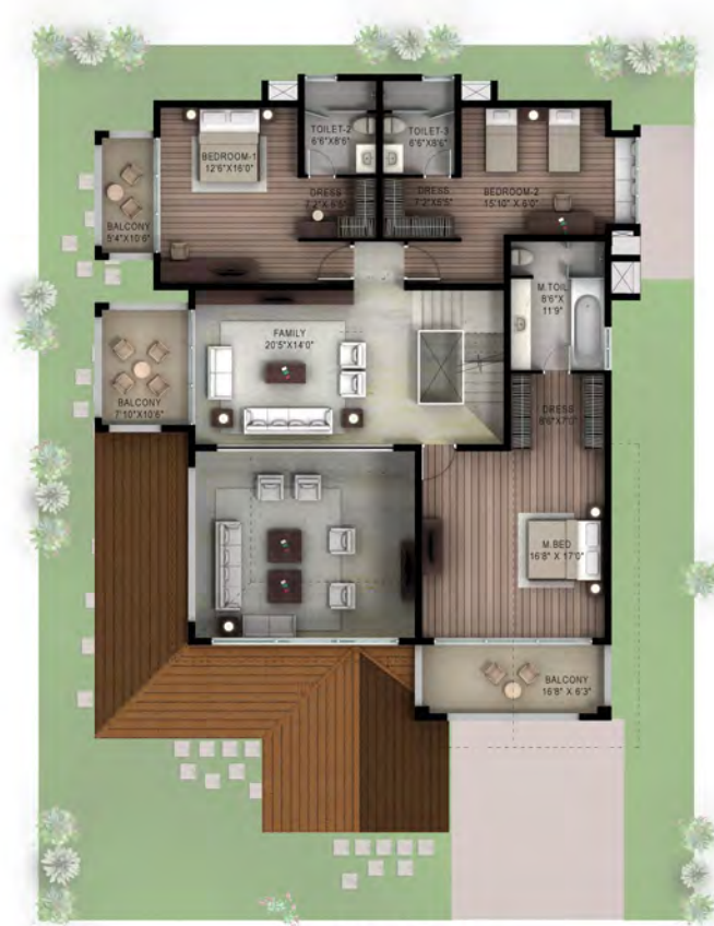
FIRST FLOOR PLAN VILL 60 X 80DH