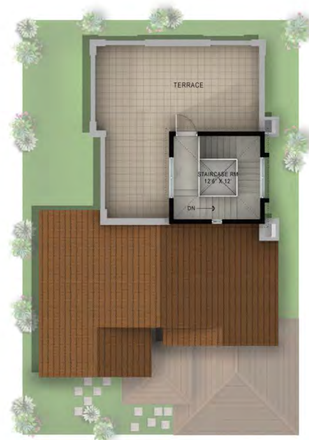
TERRACE FLOOR PLAN VILLA 40 X 60