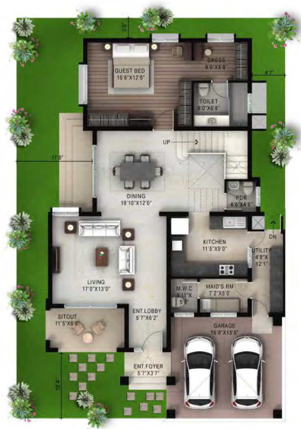
GROUND FLOOR PLAN VILLA 40 X 60