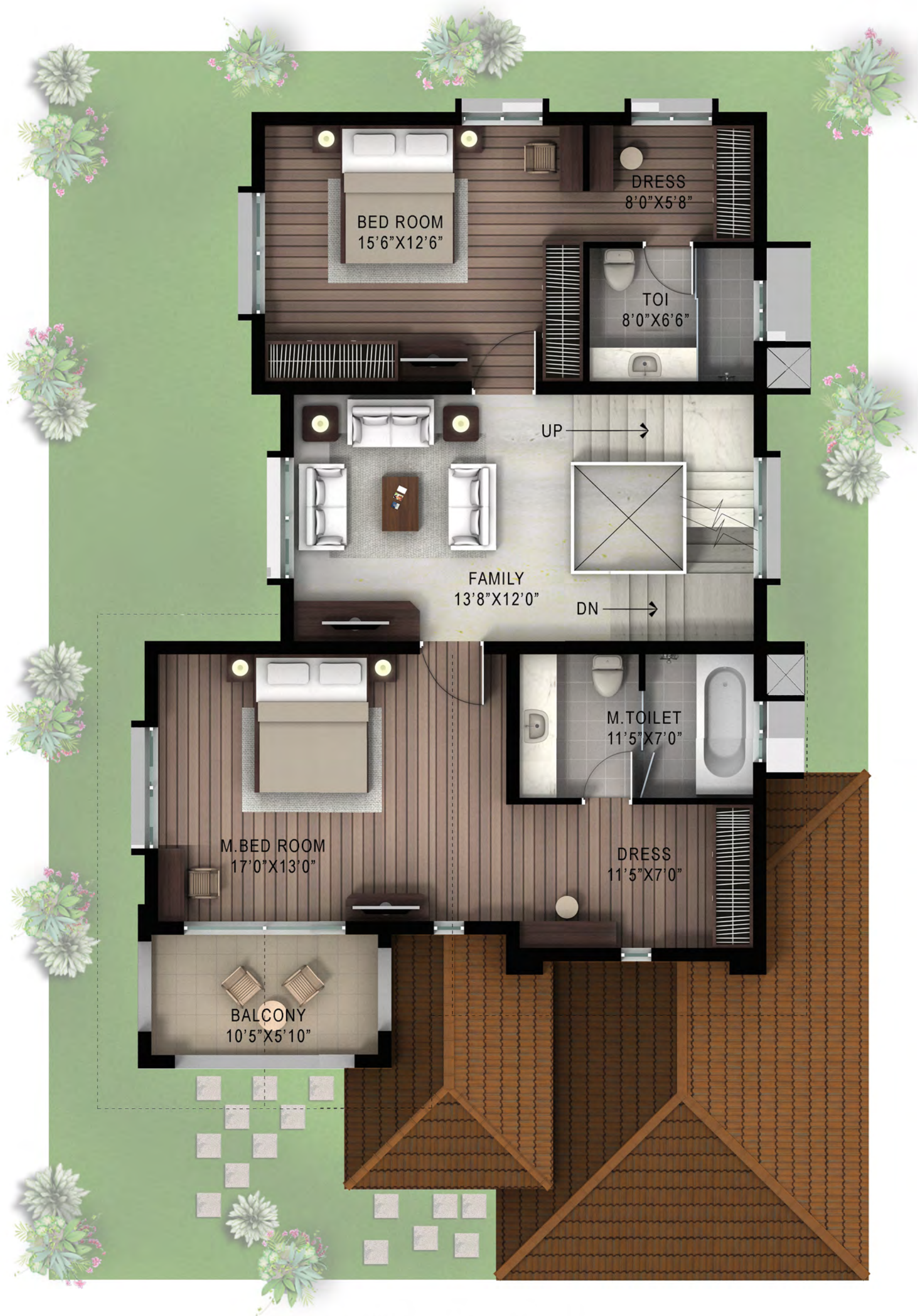
FIRST FLOOR PLAN VILLA 40 X 60