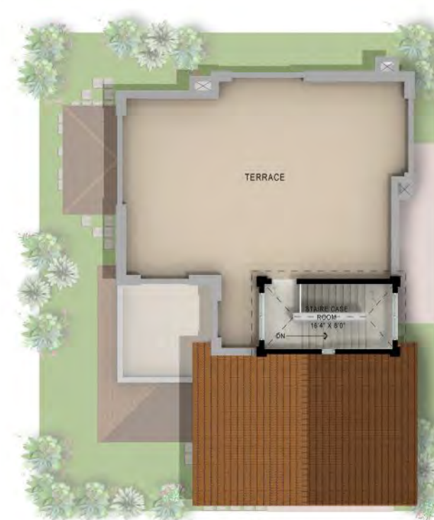
TERRACE FLOOR PLAN VILLA 50 X 60