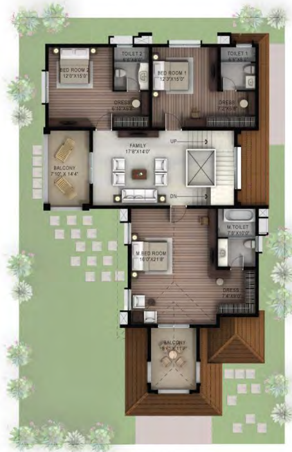
FIRST FLOOR PLAN VILLA 50 X 80