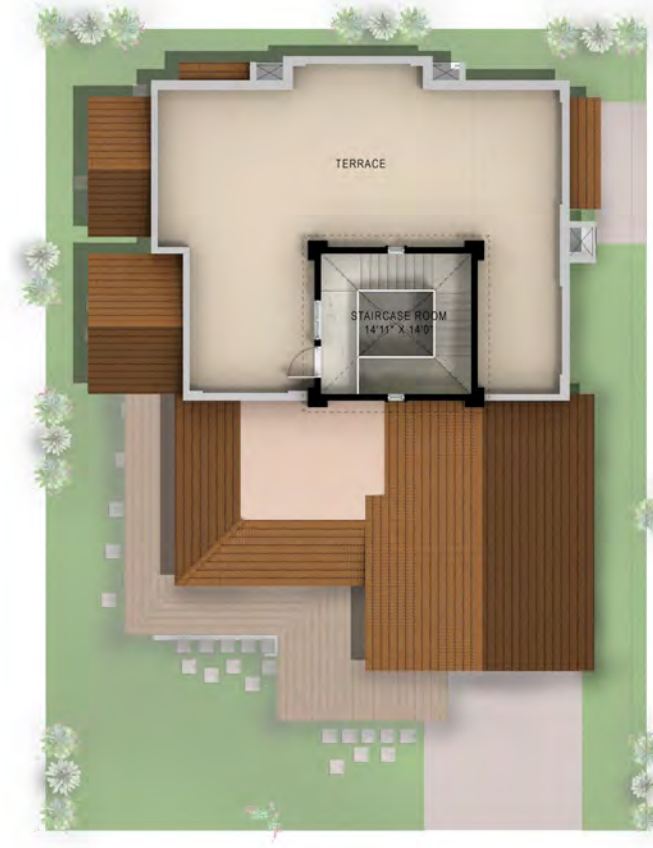
TERRACE FLOOR PLAN VILL 60 X 80DH