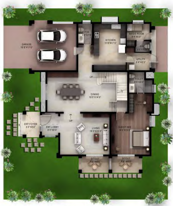
GROUND FLOOR PLAN VILLA 60 X 70