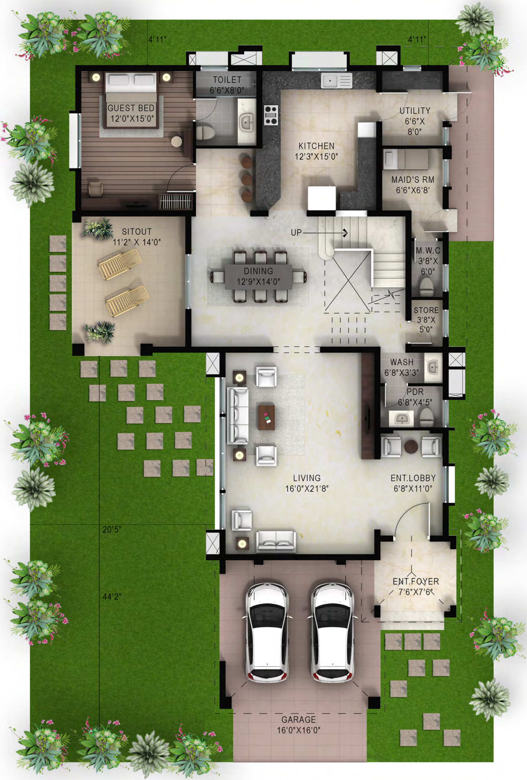
GROUND FLOOR PLAN VILLA 50 X 80