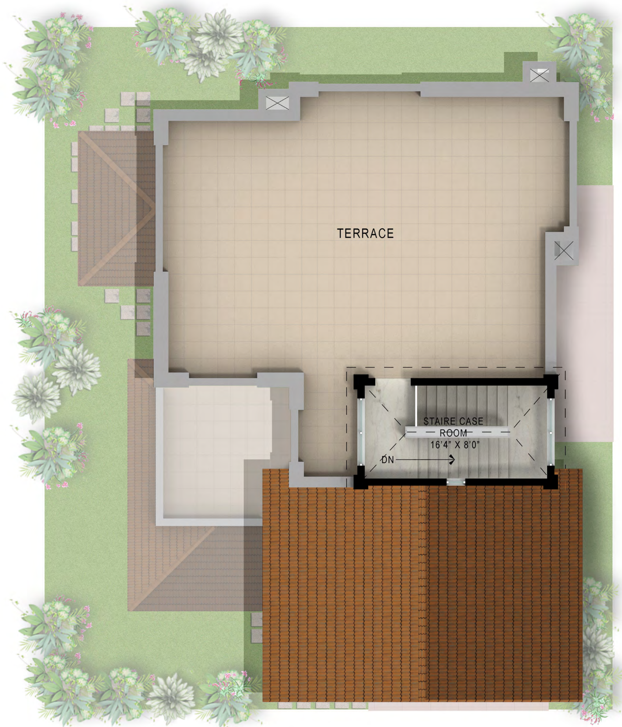
TERRACE FLOOR PLAN VILLA 50 X 60