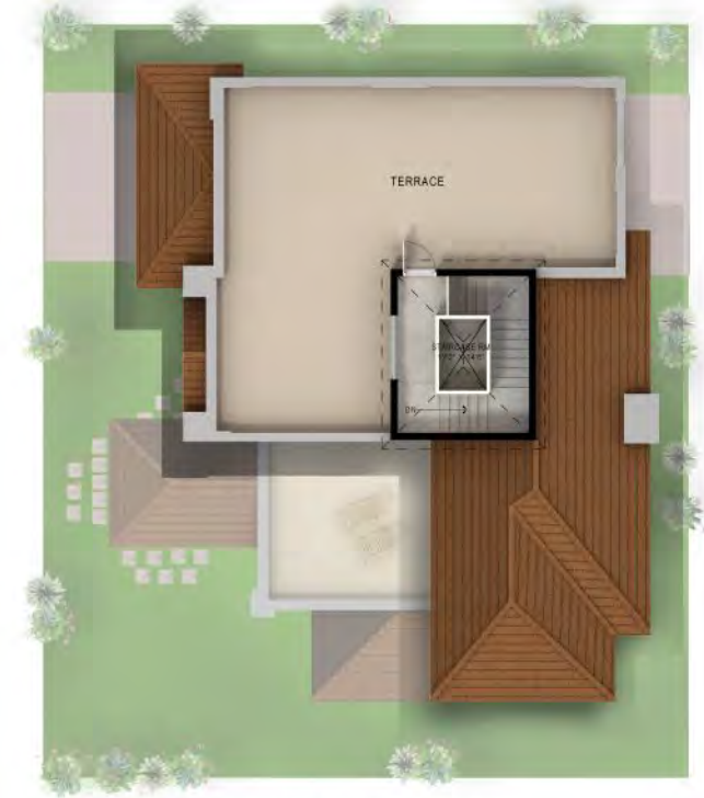
TERRACE FLOOR PLAN VILLA 60 X 70