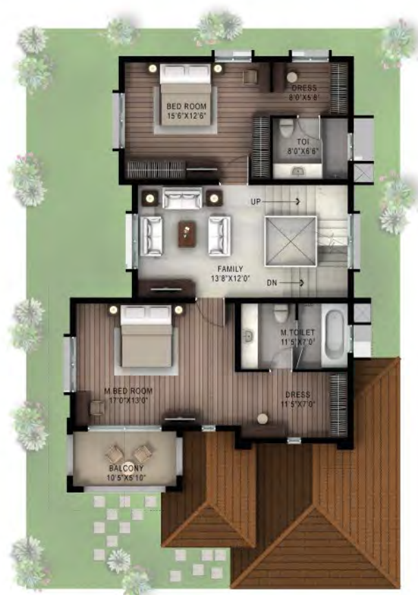
FIRST FLOOR PLAN VILLA 40 X 60