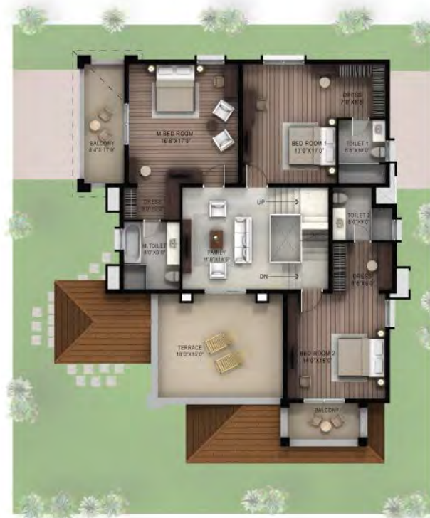
FIRST FLOOR PLAN VILLA 60 X 70