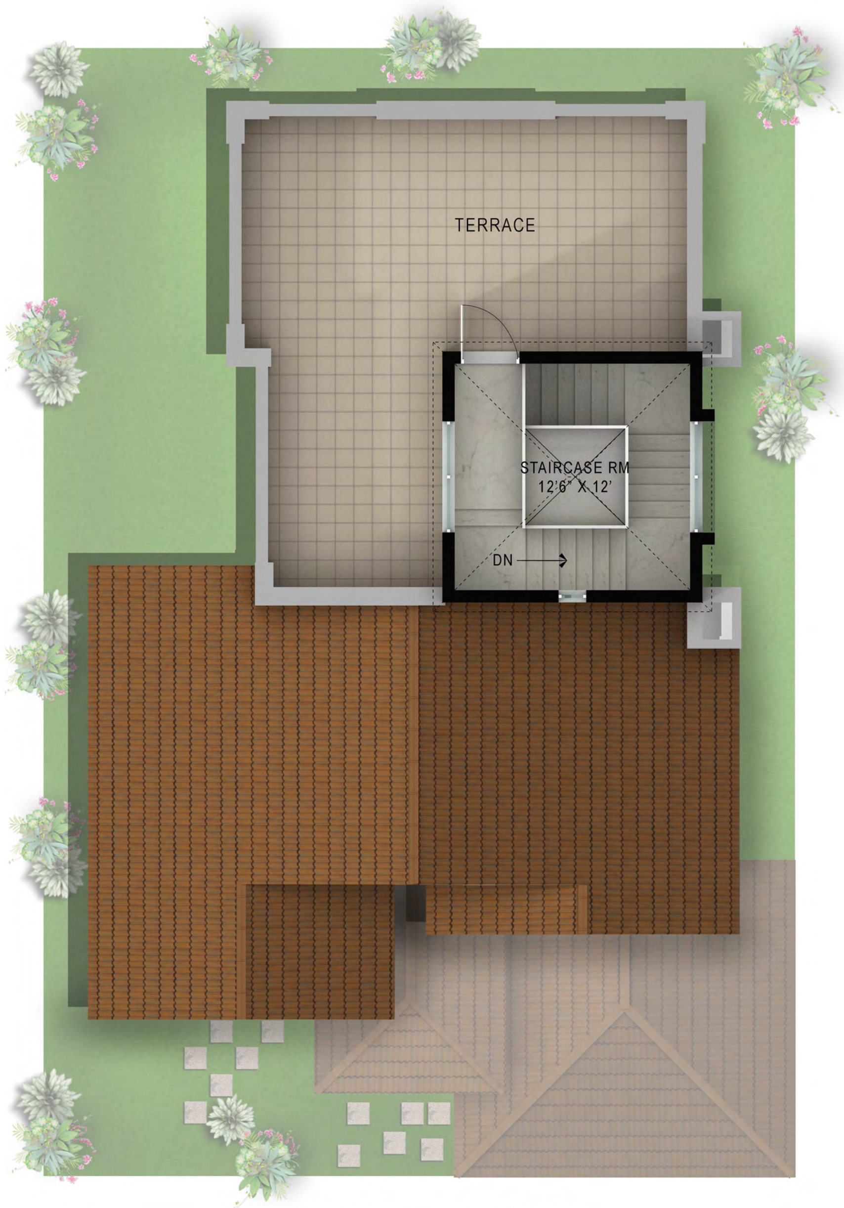
TERRACE FLOOR PLAN VILLA 40 X 60