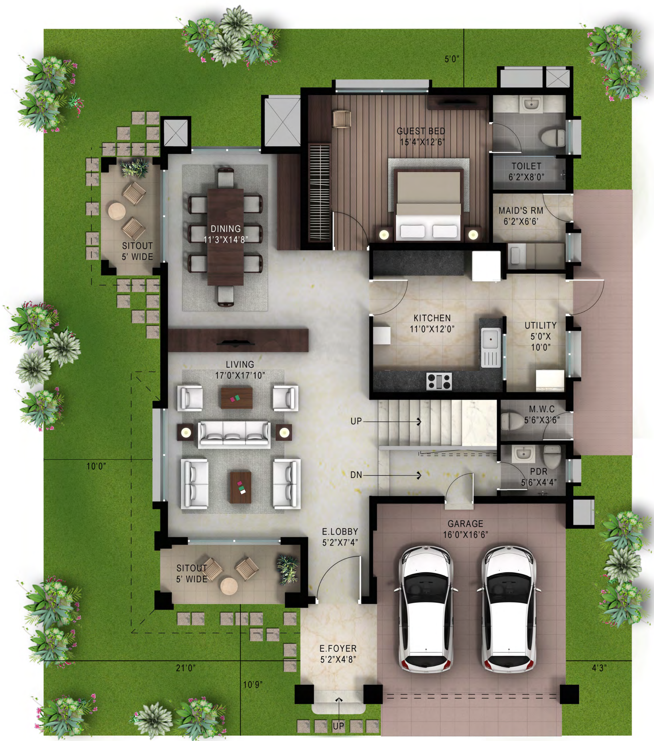
GROUND FLOOR PLAN VILLA 50 X 60